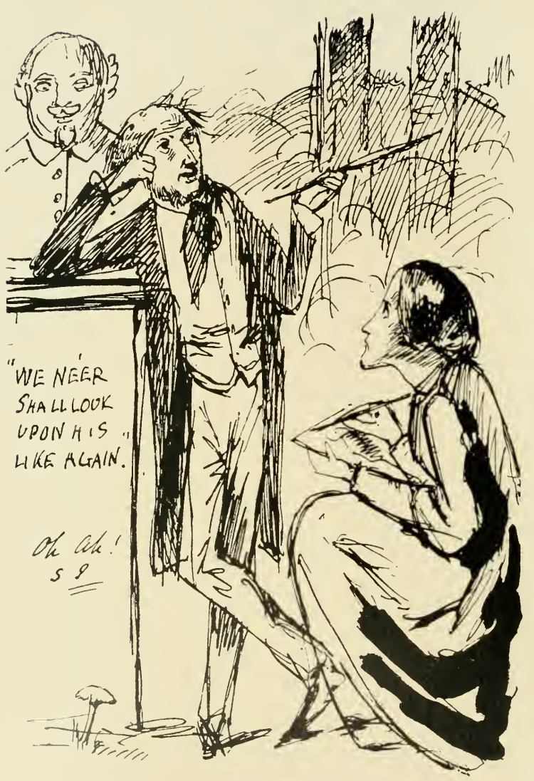
Sketch by Dante Gabriel Rossetti. See p, 22.